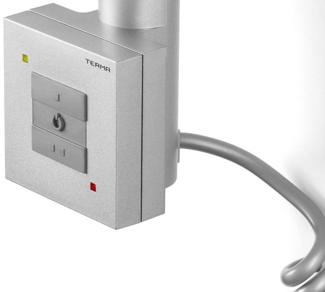
photo: silver, spiral cable