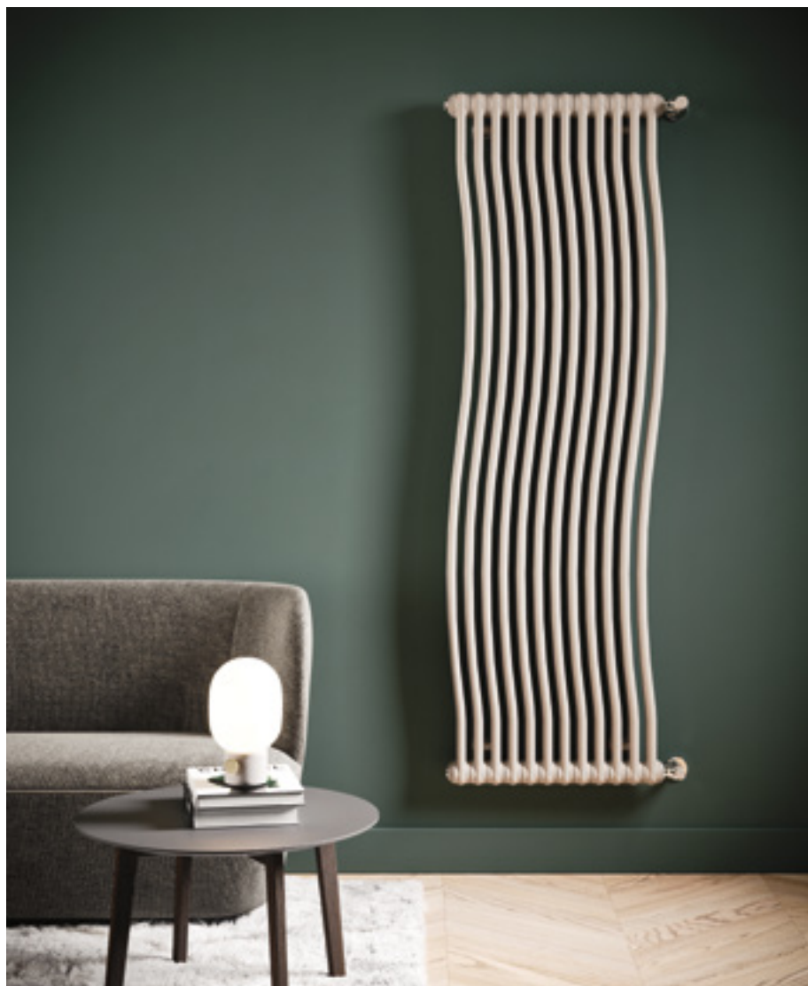
12 elements, height 1800 mm, length 571 mm. Sablé finish (cod. Y4).

The TESI RUNNER model's sinuosity is its distinctive feature and makes dynamism the absolute protagonist in every room.